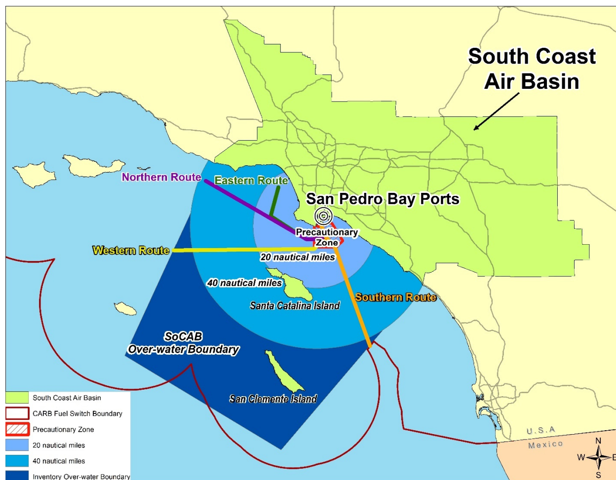
Figure 1.1: Emissions Inventory Geographical Extent

Figure 1.1 shows the over the water geographical extent of the SPBP emissions inventory, and other overlapping regulatory boundaries.