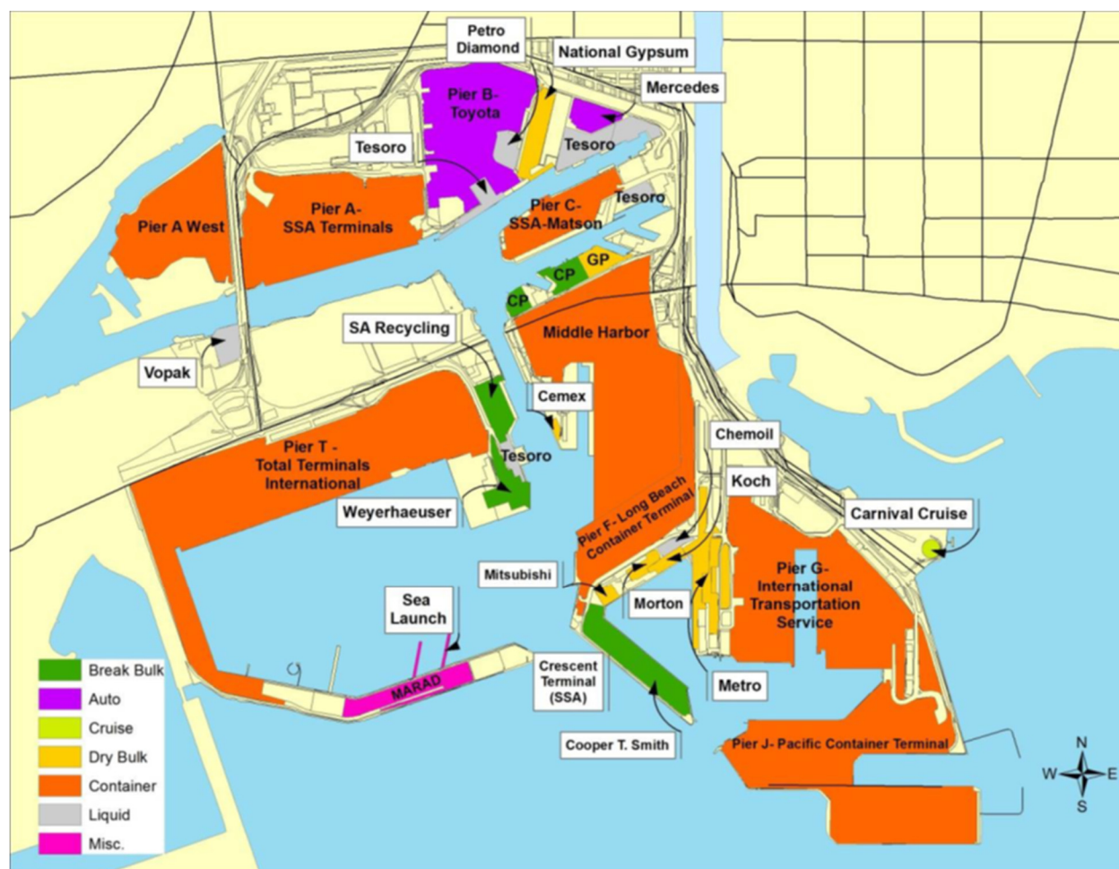
Figure 1.2: Port of Long Beach Terminals

Figures 1.2 and 1.3 show the land area of active Port terminals at the Port of Long Beach and the Port of Los Angeles, respectively. The geographical scope for cargo handling equipment is the terminals and facilities on which they operate. For the Port of Los Angeles EI report, the CHE emissions from the UP ICTF are included since UP ICTF is on port property. In the future, terminals may close or change their name, therefore the reader is cautioned to refer to the latest streamlined annual emissions reports for the latest terminal configuration and their names.